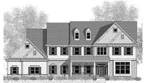
Upgraded B Elevation