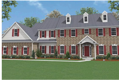
Upgraded A Elevation