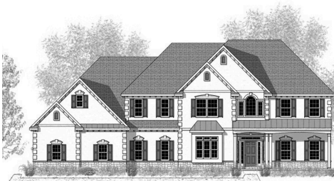
Upgraded C Elevation