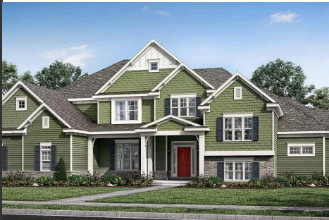
Upgraded C Elevation