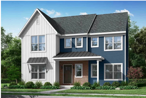
Upgraded C Trademark