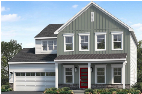
Upgraded B Transitional