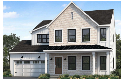
Upgraded C2 Trademark