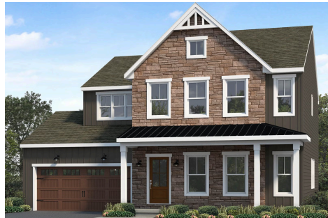
Upgraded C1 Trademark