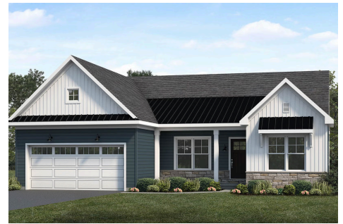
Upgraded B Transitional