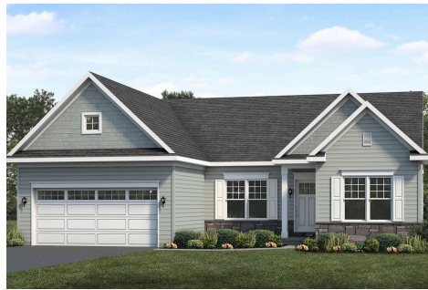
Upgraded A Traditional