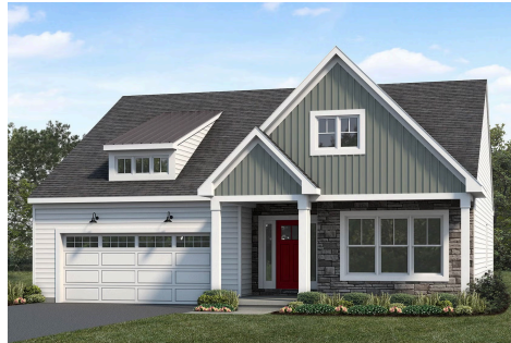
Upgraded B Transitional