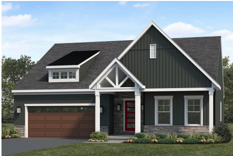
Upgraded C Trademark