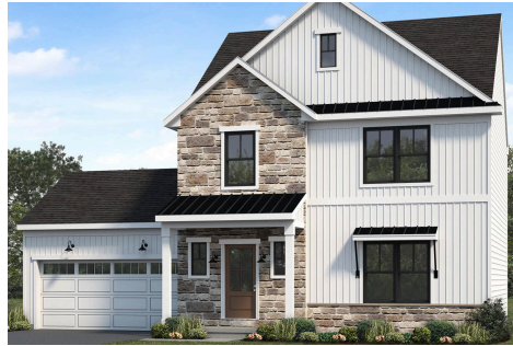
Upgraded C Trademark