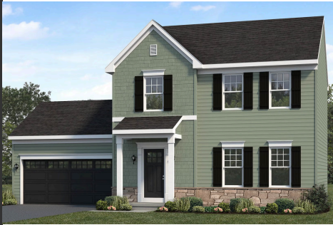
Upgraded A Traditional