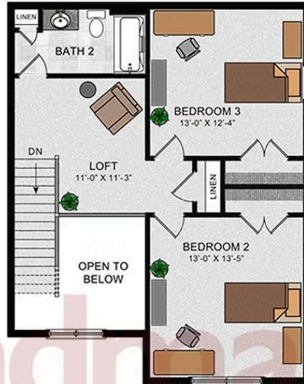
OPT. SECOND FLOOR