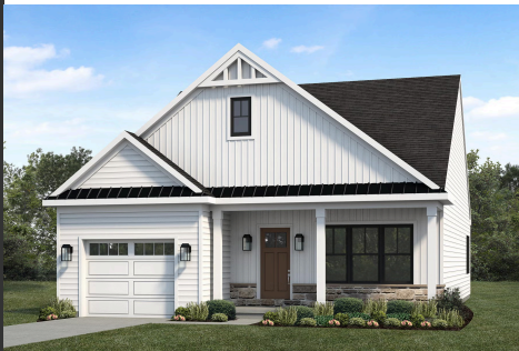
Harley 1-Story New Home Design