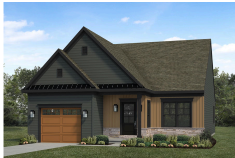
Transitional B Elevation