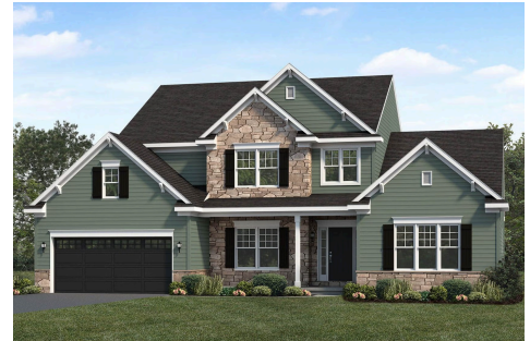
Upgraded A Traditional