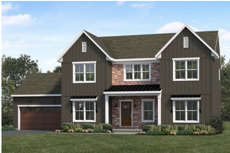
Upgraded C Trademark