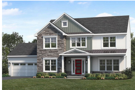
Upgraded B Transitional