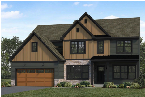
Upgraded Transitional B

This two-story home with over 3,000 sq. feet includes a 2-car garage with mudroom entry. To the front of the home is a versatile living room and a formal dining room with an optional tray ceiling. A 2-story great room with optional gas fireplace opens to the breakfast area and kitchen. The laundry room is on the 2nd floor convenient to the bedrooms. The owner's suite with an expansive closet and private bathroom can be upgraded. An optional recreation room can be added to the 2nd floor for additional living space. A grand, 2-story foyer option can also be added to the home. (Pricing may reflect limited-time savings/incentives. See Community Sales Manager for details.)