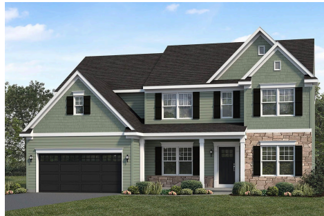
Upgraded Traditional A