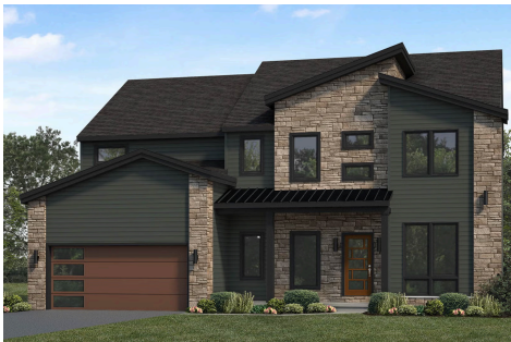
Upgraded Contemporary Elevation