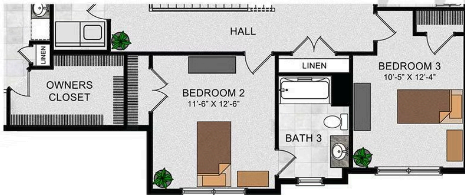
OPTIONAL BEDROOM 2 FULL BATH