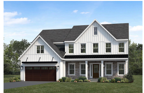
Upgraded Trademark C