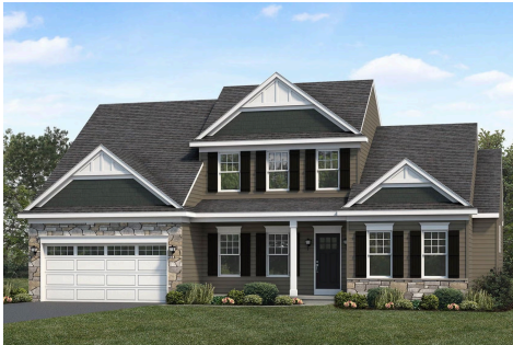
Upgraded Traditional A