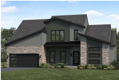
Upgraded Contemporary Elevation