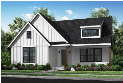
Upgraded C Trademark