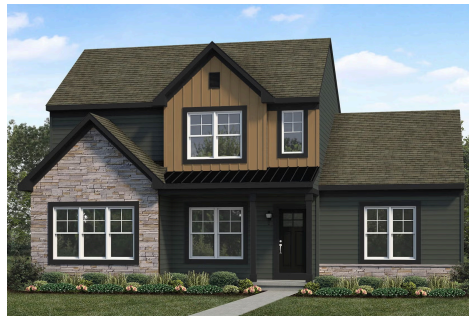
Transitional B Elevation