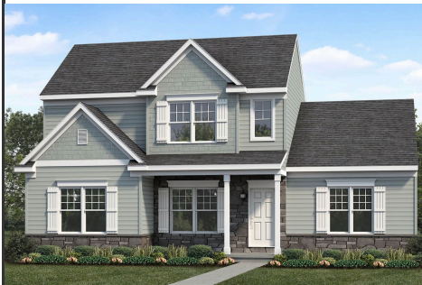
Traditional A Elevation