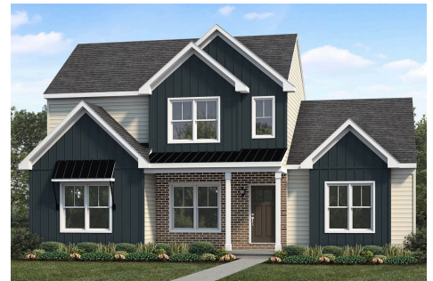
Trademark C Elevation