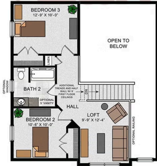
OPTIONAL SECOND FLOOR W/ LOFT AND BEDROOM 3