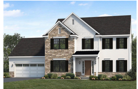
Upgraded A Traditional