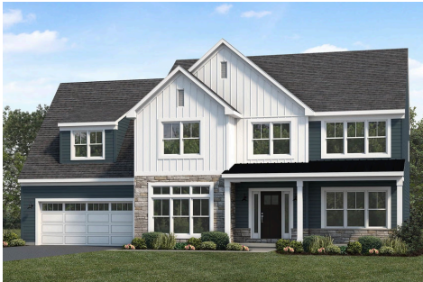
Upgraded B Transitional