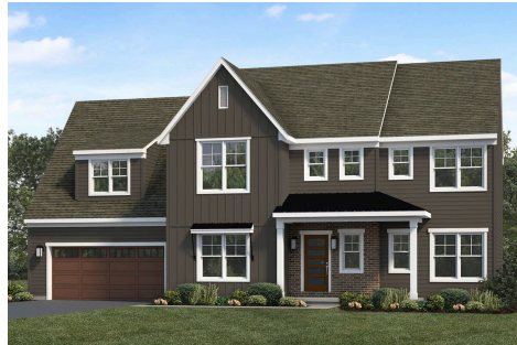
Upgraded C Trademark