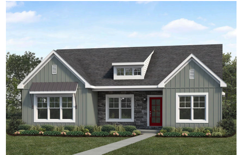
Upgraded B Transitional