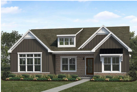
Upgraded C Trademark

Ideal first-floor living with private owner's suite tucked away in its own corner of the home. With over 1,800 square feet, 2 bedrooms, and 2 full baths, plus open living areas, this is a perfect home for entertaining guests. The kitchen is open to a spacious family room and the sunny dining area. Off of the 2-car, alley load garage is a convenient mudroom entry.