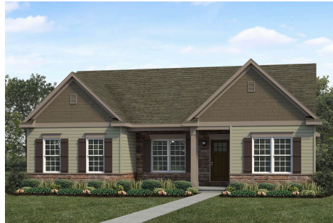
Upgraded A Traditional