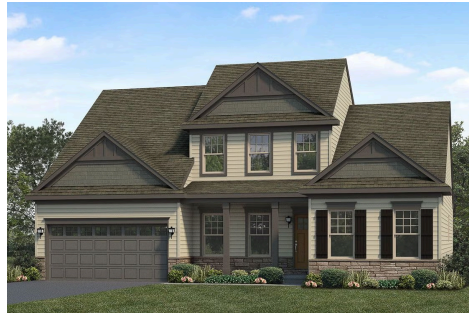
Upgraded A Traditional