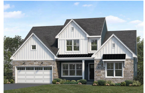
Upgraded B Transitional