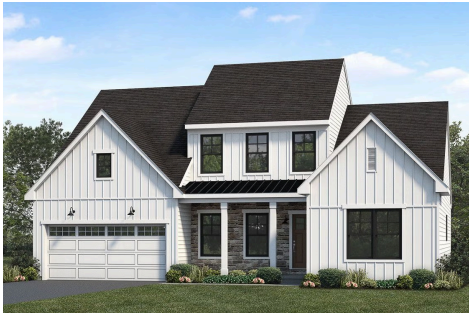
Upgraded C Trademark

This home has so many great options that you can customize to your liking! Interior is well-appointed with a first-floor owner's suite, vaulted great room that flows into an eat-in kitchen with generous pantry, cabinets, and counter space. Formal dining room and study flank a traditional foyer with view of the 2-story great room. Don't need a study? You can have two owner's bedrooms instead!