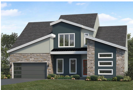
Upgraded Contemporary Elevation