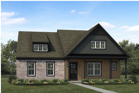
Upgraded B Transitional

Convenient first-floor living with a charming exterior design, including a welcoming front porch. The Answorth features an open floor plan, a 2-car, alley load garage with mudroom entry, and a second-floor with loft space and 2 additional bedrooms and full bathroom. The owner's suite is situated in its own corner of the house, with a private bathroom and expansive closet. The kitchen, dining room, and living room share an open floor plan for ease of entertaining and relaxing. Explore all the options available to make the Answorth model suit your personal needs!