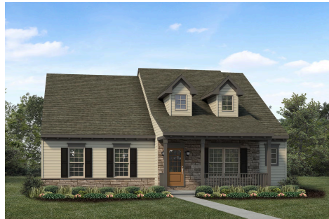
Upgraded A Traditional