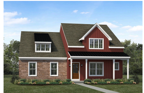
Upgraded C Trademark