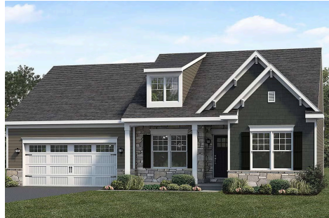
Upgraded Traditional A