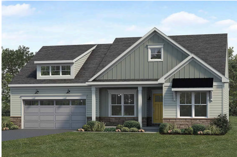
Upgraded Transitional B

This one-story home features 2 bedrooms and 2 full baths with optional flex space to be used for either a study or a third bedroom. The kitchen is oversized, offering plenty of counter space and storage. The open floor plan includes a great room with an optional fireplace and a dining room, both of which are open to the kitchen. The private owner's suite features a bedroom with optional tray ceiling, an oversized closet, and a private bathroom conveniently located adjacent to the laundry room. (Pricing may reflect limited-time savings/incentives. See Community Sales Manager for details.)