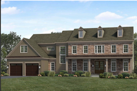
Upgraded A Traditional