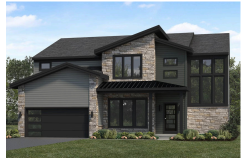
Upgraded Contemporary Elevation