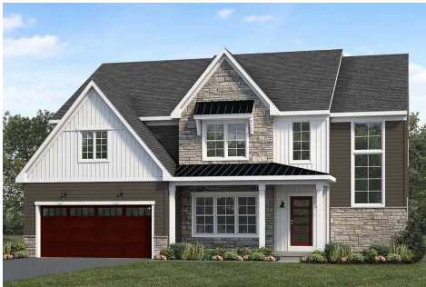
Upgraded B Transitional