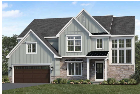
Upgraded C Trademark