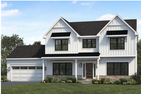
Upgraded Trademark C

A gorgeous, well-planned family home offering three roomy bedrooms and an owner's suite with a private bath, double bowl vanity, and spacious closet. A flex space room and dining room flank the foyer upon entering this stately home. The large family room with optional fireplace flows comfortably into the sunlit breakfast area. The open kitchen has an optional center island for even more working space.