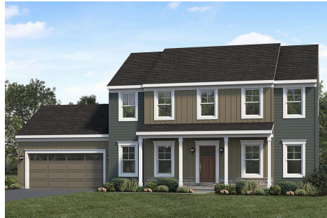
Upgraded Traditional A