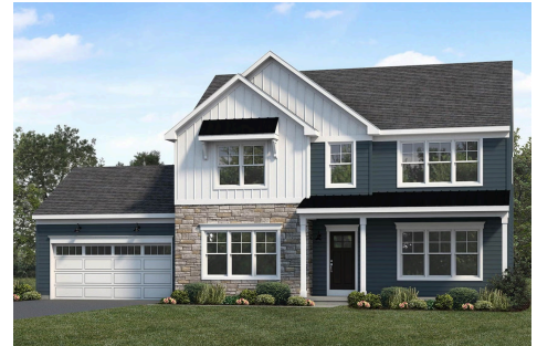
Upgraded Transitional B