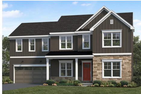
Upgraded Transitional B