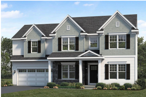
Upgraded Traditional A