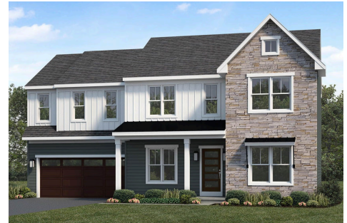
Upgraded Trademark C