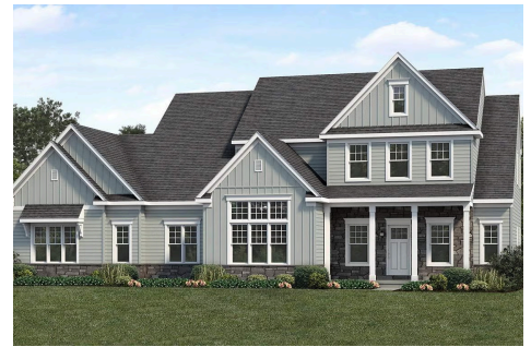
Upgraded A Traditional