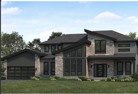
Upgraded Contemporary Elevation