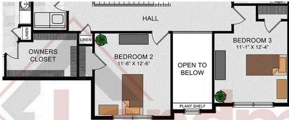
OPTIONAL BEDROOM 2 FULL BATH