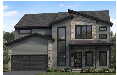
Upgraded Contemporary Elevation