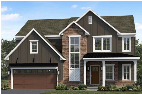
Upgraded C Trademark