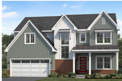
Upgraded B Transitional