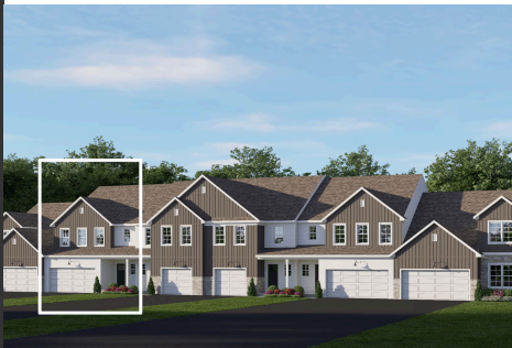
Mason Exterior Design