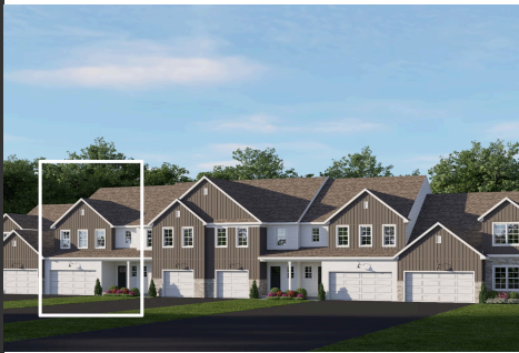
Mason Exterior Design