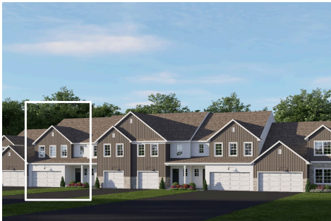
Mason Exterior Design