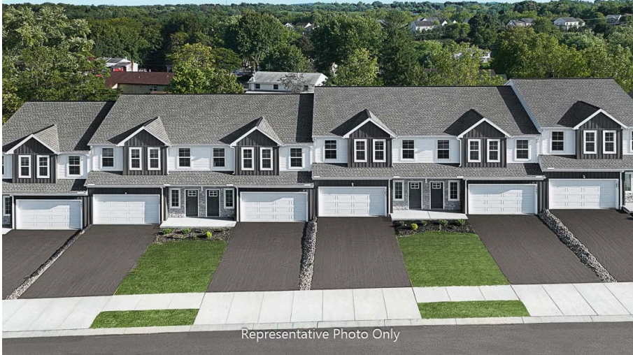
Representative Photo Only