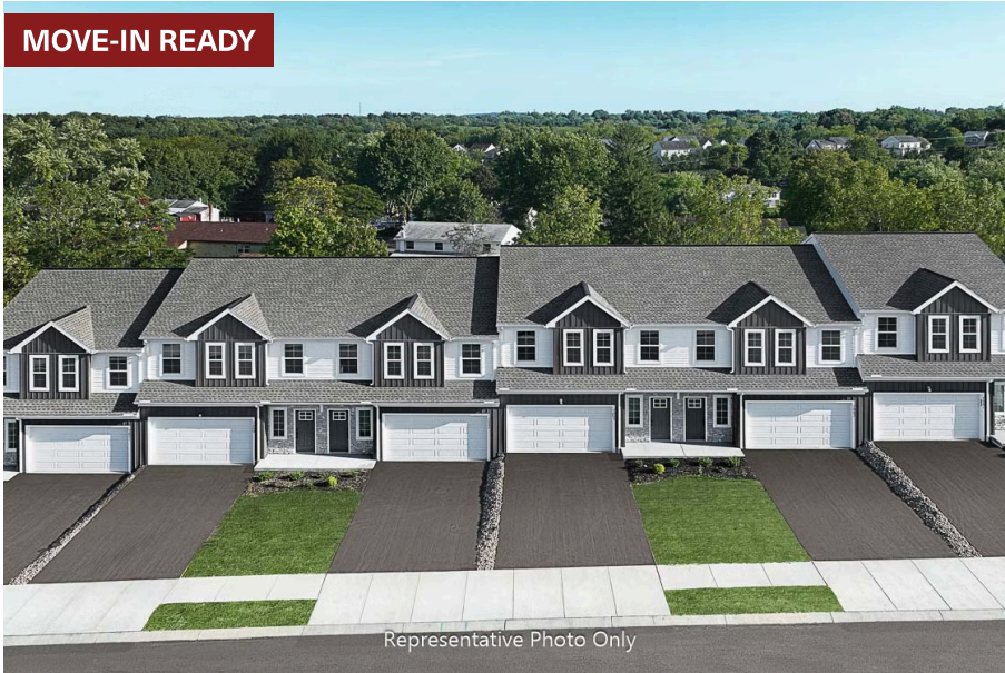
Representative Photo Only