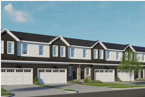
Harper Townhome Exterior