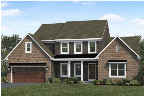
Upgraded C Trademark

Distinguished, elegant exterior offers a timeless design with all the amenities you need for your busy lifestyle. The ample eat-in kitchen features abundant countertops and cabinets. Open and spacious family room perfect for entertaining or growing families. Many custom features at attainable prices.