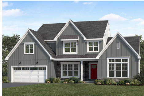
Upgraded B Transitional