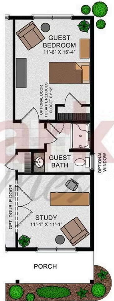
OPTIONAL FIRST FLOOR GUEST SUITE