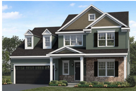
Upgraded A Traditional