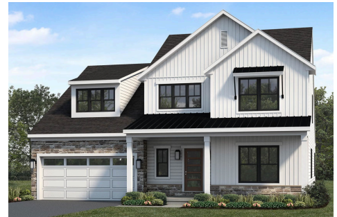
Upgraded C Trademark