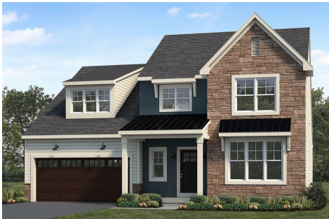
Upgraded B Transitional