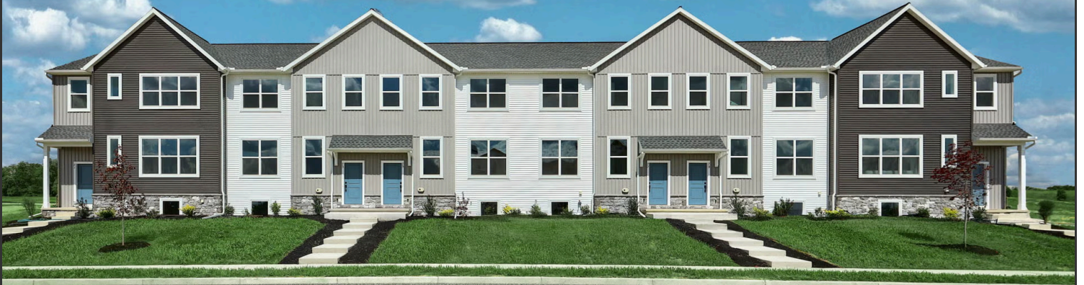
Representative Photo Only