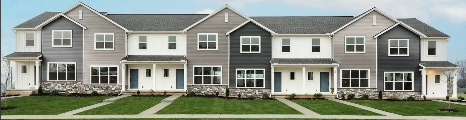
Representative Photo Only