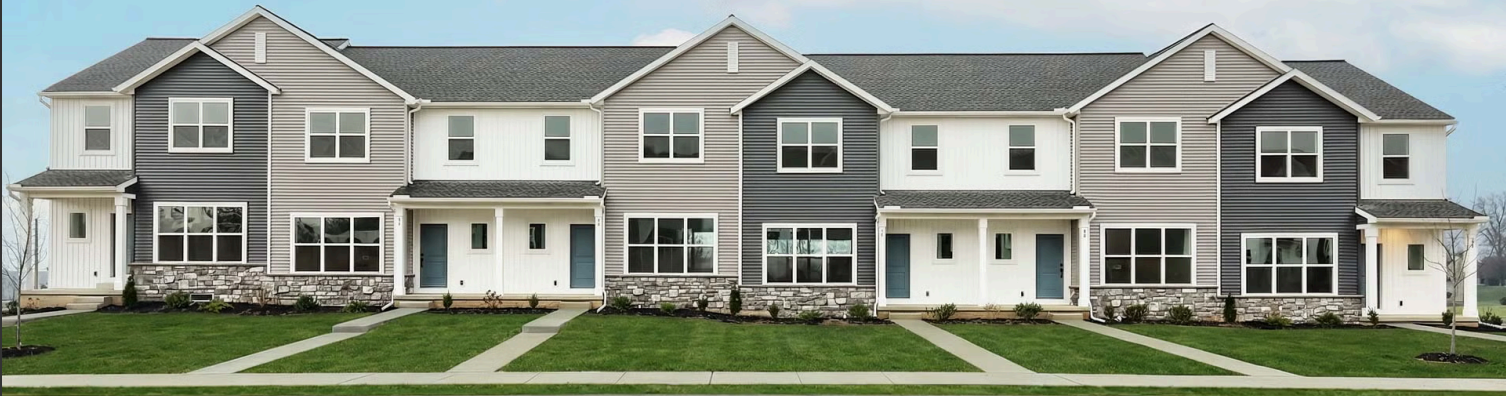
Representative Photo Only