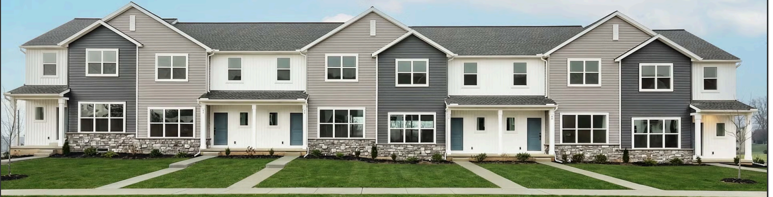
Representative Photo Only