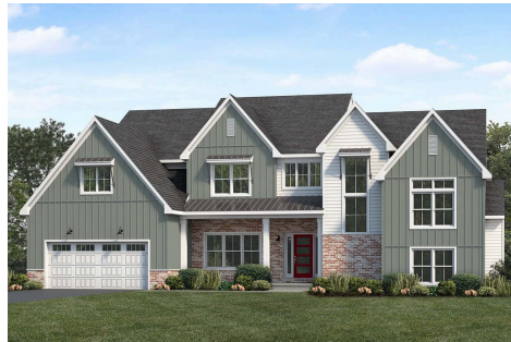
Westminster B Transitional Elevation