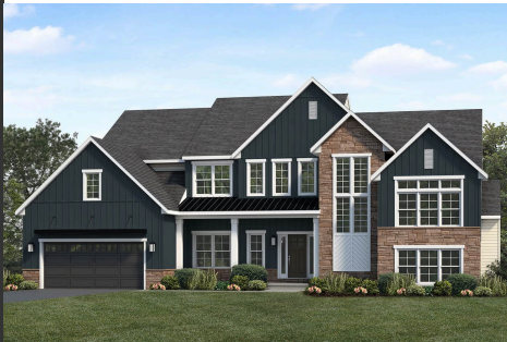
Westminster C Trademark Elevation