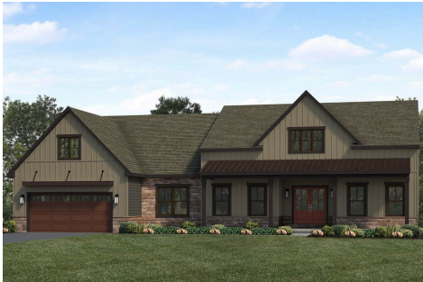
Upgraded C Trademark