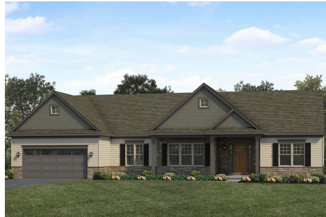
Upgraded A Traditional