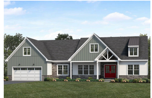
Upgraded B Transitional