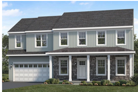
Upgraded Traditional A