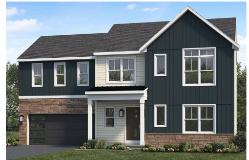
Upgraded Trademark C