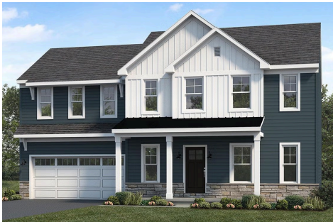
Upgraded Transitional B