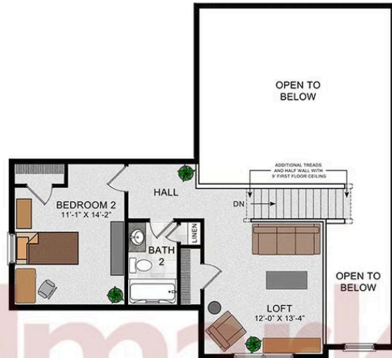
OPT. SECOND FLOOR W/ LOFT