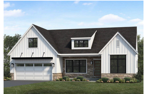
Upgraded Trademark C