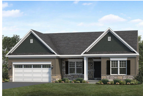
Upgraded Traditional A