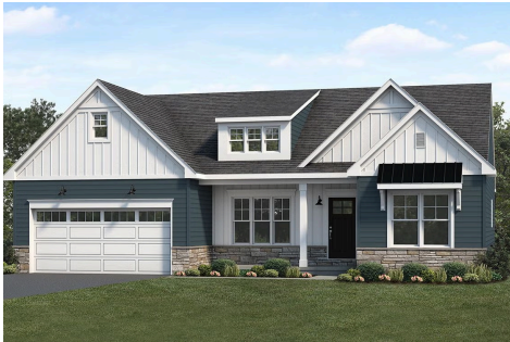
Upgraded Transitional B

Ideal first-floor living with private owner's suite tucked away in its own corner of the home. With over 1,800 square feet, 2 bedrooms, and 2 full baths, plus open living areas, this is a perfect home for entertaining guests. The kitchen is open to a spacious family room and the sunny dining area. Off of the 2-car garage is a convenient mudroom entry.