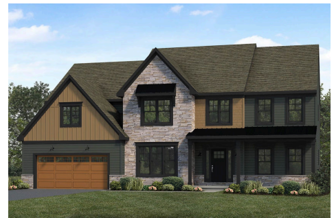
Upgraded B Transitional