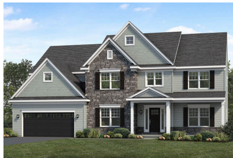
Upgraded A Traditional