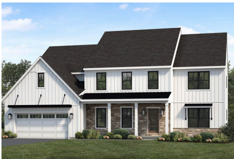
Upgraded C Trademark

Lots of room in this two-story, 4,000+ sq ft home with 4 bedrooms, 2.5 baths, and a 2-car garage. Plenty of space for relaxing and entertaining with a floor plan that includes a great room with 2-story ceilings, living room, study, and formal dining room. Kitchen opens to sunny breakfast area, with access to the patio (or optional deck). Owner's suite (with optional tray ceiling) includes dressing area, double closets, and a private bath with optional whirlpool. (Pricing may reflect limited-time savings/incentives. See Community Sales Manager for details.)