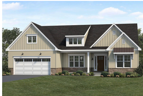
Upgraded B Transitional