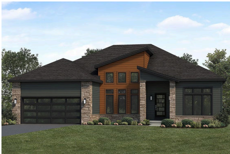
Upgraded Contemporary Elevation