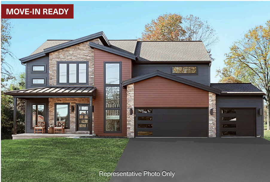
Representative Photo Only