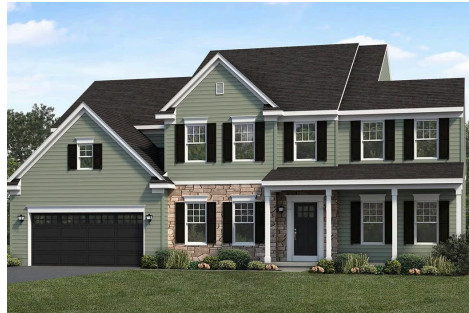
Upgraded A Traditional