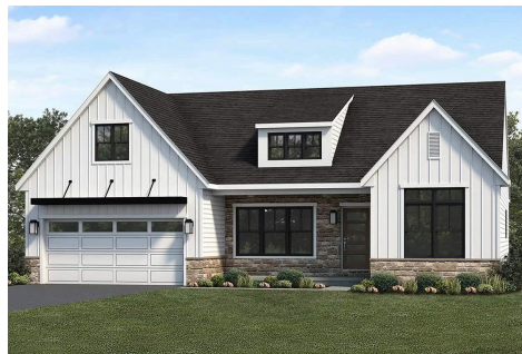
Upgraded C Trademark