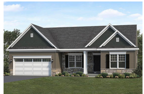
Upgraded A Traditional