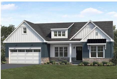
Upgraded B Transitional