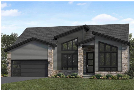
Upgraded Contemporary Elevation