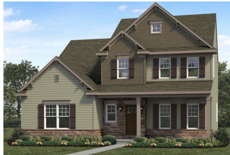
Upgraded A Traditional