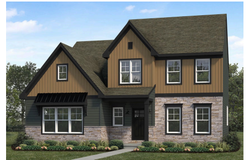
Upgraded B Transitional