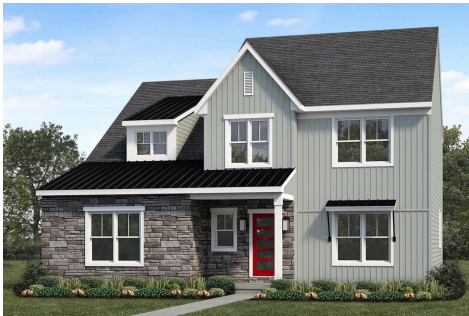
Upgraded C Trademark